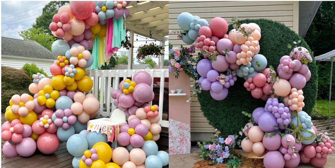
10ft Free Standing

Balloon Garland design placed on clients backdrop or styled on the wall